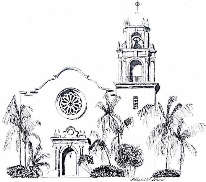
Christ Episcopal Church (Bradenton, Florida)