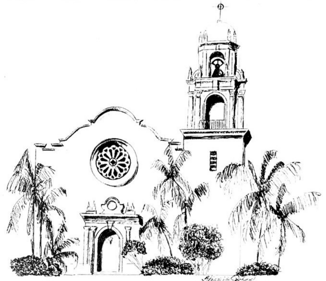
Christ Episcopal Church Bradenton, Florida

THE HOLY EUCHARIST WITH THE RITE OF CONFIRMATION Sunday, May 19, 2024 11:00 a.m.